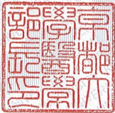
Seal of the Faculty of Medicine Kyoto University

This is to certify that the above mentioned person has been enrolled in the Undergraduate program majoring in Medical Science at the Faculty of Medicine, Kyoto University since April 1, 2023.