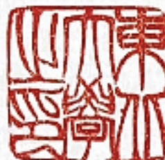
Official Seal of Tohoku University